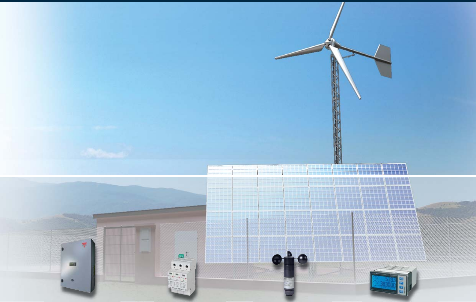
Wind battery charger